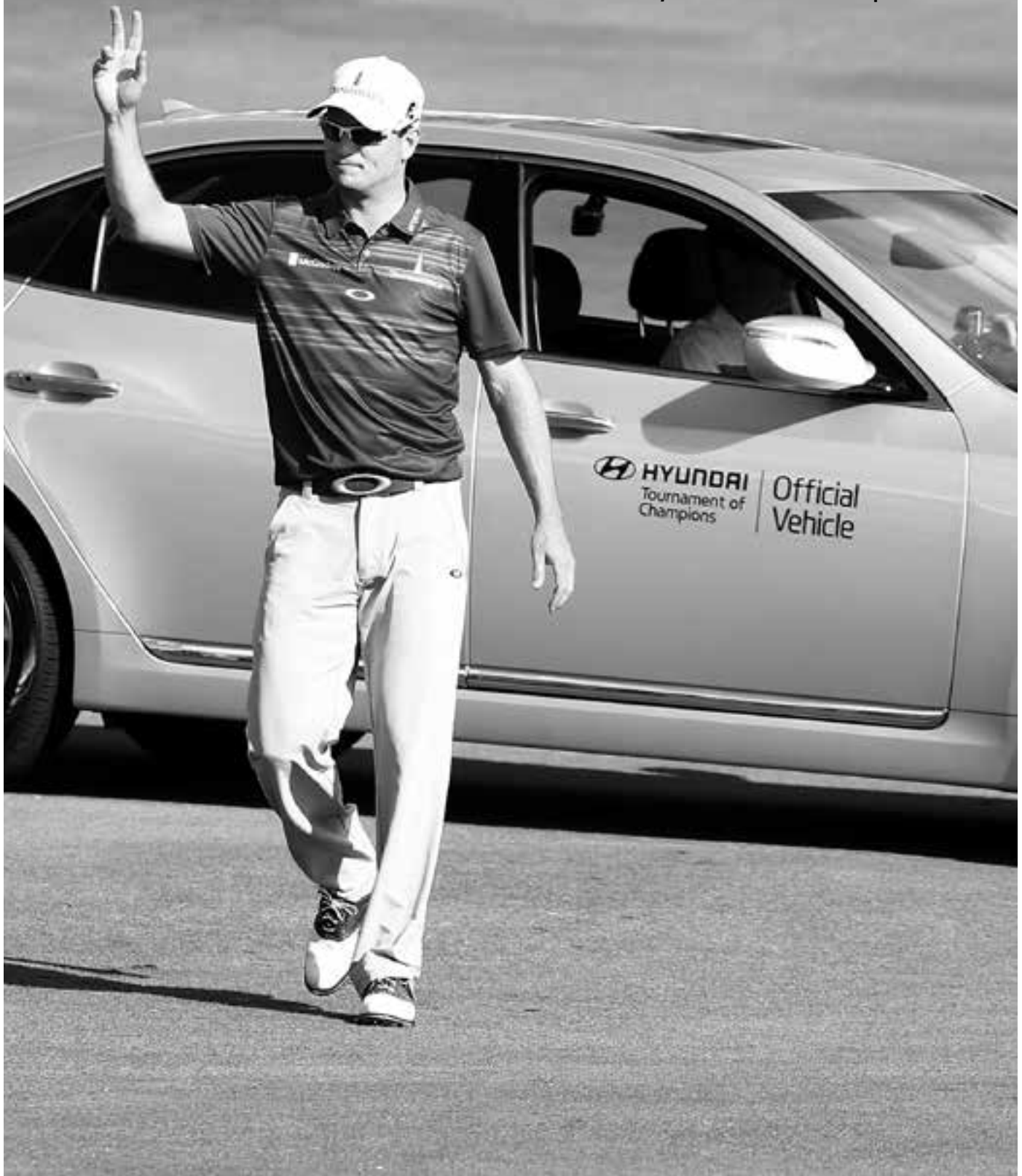
Zach Johnson after winning the 2014 Hyundai Tournament of Champions