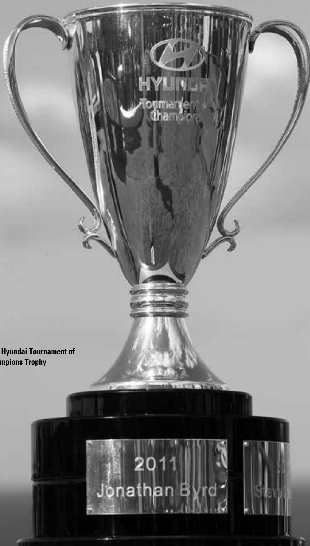
The Hyundai Tournament of Champions Trophy