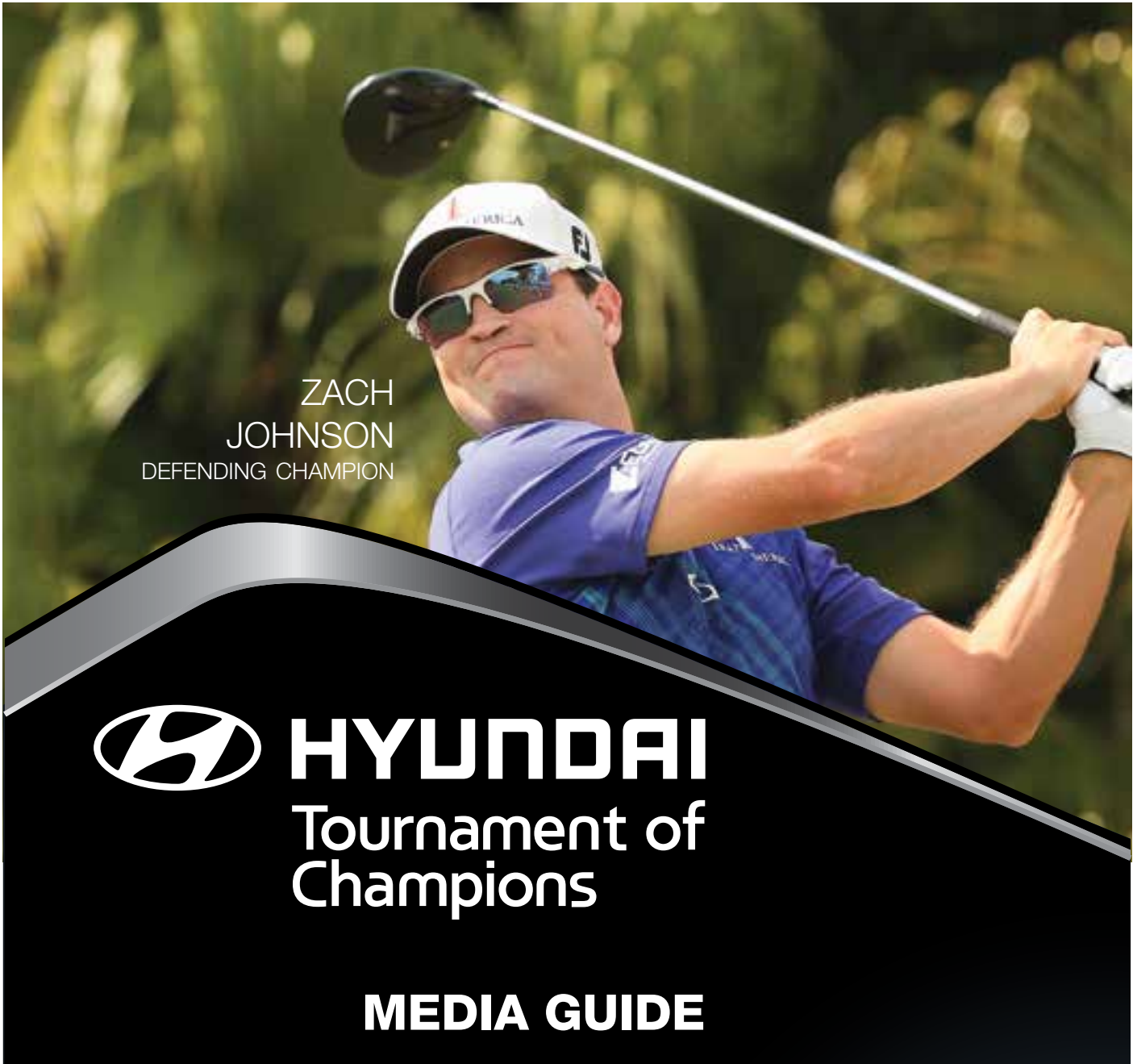
ZACH JOHNSON DEFENDING CHAMPION