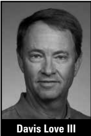
Davis Love III

TPC Sawgrass Ponte Vedra Beach, FL March 27-30, 2003 Purse: $6,500,000 Par: 36-36—72 Yards: 7,093