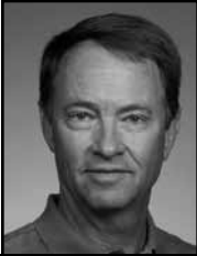
Davis Love III

TPC Sawgrass Ponte Vedra Beach, FL March 26-29 Purse: $1,800,000 Par: 36-36—72 Yards: 6,896