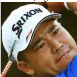
Japan MATSUYAMA, Hideki