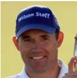
Republic of Ireland HARRINGTON,Padraig