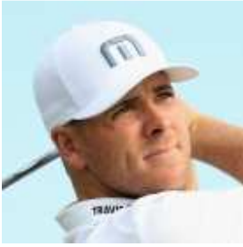
USA LIST, Luke 07:08 4