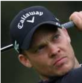
England WILLETT, Danny