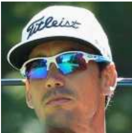
Spain CABRERA BELLO, Rafa 08:14 10