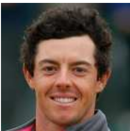
Northern Ireland McILROY, Rory