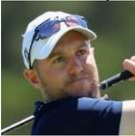
England SOUTHGATE, Matthew 06:57 3