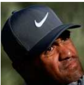
USA FINAU, Tony