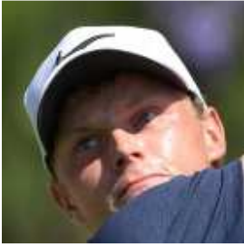
Australia DAVIS,Cameron 11:47 28