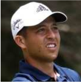
USA SCHAUFFELE, Xander