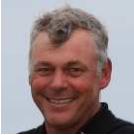
Northern Ireland CLARKE, Darren