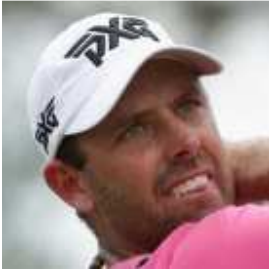
South Africa SCHWARTZEL, Charl