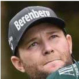
South Africa GRACE,Branden 13:37 38