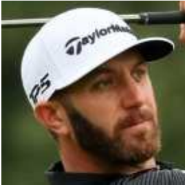
USA JOHNSON, Dustin