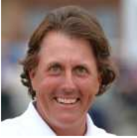
USA MICKELSON, Phil