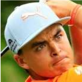
USA FOWLER, Rickie