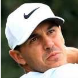
USA KOEPKA, Brooks 10:09 20