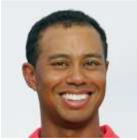
USA WOODS, Tiger