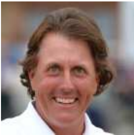
USA MICKELSON, Phil