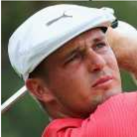
USA DeCHAMBEAU, Bryson