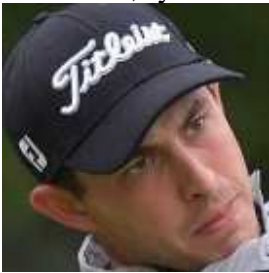
USA CANTLAY, Patrick