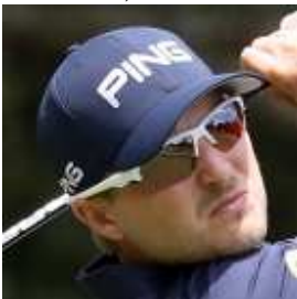
USA COOK,Austin 12:42 33