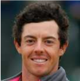
Northern Ireland McILROY, Rory