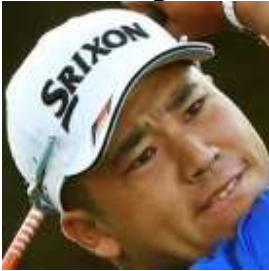
Japan MATSUYAMA, Hideki