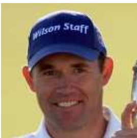
Republic of Ireland HARRINGTON, Padraig