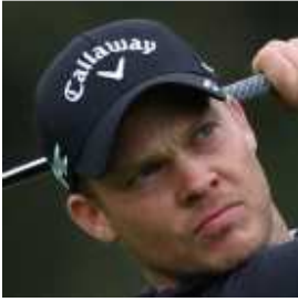
England WILLETT, Danny