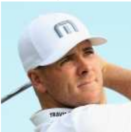
USA LIST, Luke 12:09 30