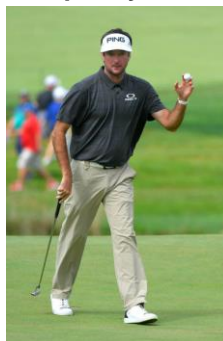
Bubba Watson (8 th )