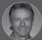
2010, 2014, 2015, 2016 Bernhard Langer