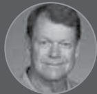
2003, 2005 Tom Watson