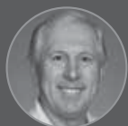
2002, 2004 Hale Irwin