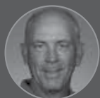
2011, 2012 Tom Lehman