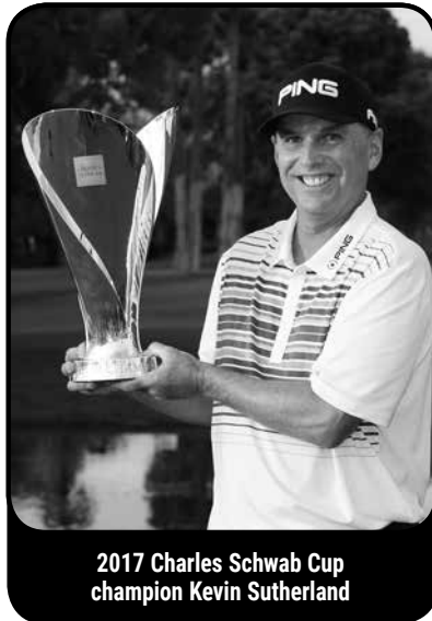
2017 Charles Schwab Cup champion Kevin Sutherland

After tying for 12th in the season finale, Langer finished second in the Charles Schwab Cup, his sixth consecutive top-two finish in the season-long competition. Though he was unable to win his fourth straight Charles Schwab Cup, he set many new records during the season – he became the second player to win three senior majors in one year, he became the Tour's all-time leader in major wins (10), he broke the single-season money record ($3,677,359), and he won his sixth straight money title. The most elusive PGA TOUR Champions record remains, however, as his 36 career victories is nine shy of Hale Irwin's record 45 wins.