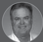
2013 Kenny Perry