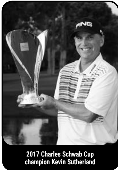
2017 Charles Schwab Cup champion Kevin Sutherland

After tying for 12th in the season finale, Langer finished second in the Charles Schwab Cup, his sixth consecutive top-two finish in the season-long competition. Though he was unable to win his fourth straight Charles Schwab Cup, he set many new records during the season – he became the second player to win three senior majors in one year, he became the Tour's all-time leader in major wins (10), he broke the single-season money record ($3,677,359), and he won his sixth straight money title. The most elusive PGA TOUR Champions record remains, however, as his 36 career victories is nine shy of Hale Irwin's record 45 wins.