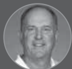
2006, 2008 Jay Haas