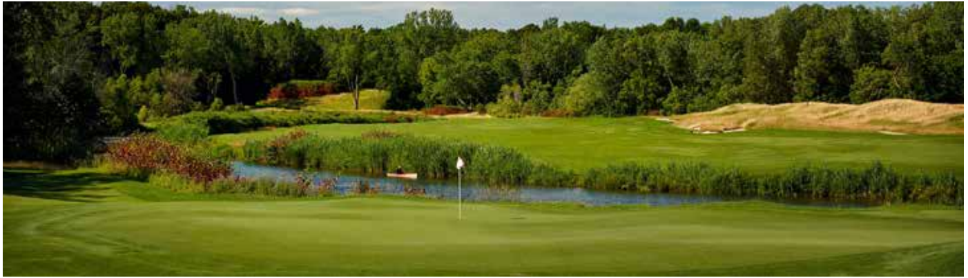
Harbor Shores, Benton Harbor, Michigan