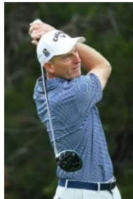
Driving Accuracy Leaders PGA TOUR This Season

Jim Furyk currently leads the TOUR in Driving Accuracy hitting his mark 80.1% of the time off the tee. Jim Furyk & Chez Reavie are the only players who have ranked inside of the top-10 in Driving Accuracy in each of the last four seasons on TOUR (including this season).