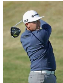
Times Ranked Inside Top-10 Driving Acc. PGA TOUR Since 2015-16