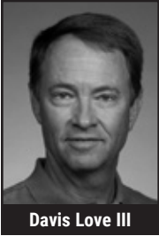
Davis Love III

TPC Sawgrass Ponte Vedra Beach, FL March 27-30, 2003 Purse: $6,500,000 Par: 36-36-72 Yards: 7,093