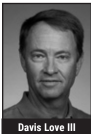
Davis Love III

TPC Sawgrass Ponte Vedra Beach, FL March 26-29 Purse: $1,800,000 Par: 36-36-72 Yards: 6,896