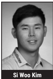
Si Woo Kim

TPC Sawgrass Ponte Vedra Beach, FL May 8-14, 2017 Purse: $10,500,000 Par: 36-36-72 Yards: 7,189