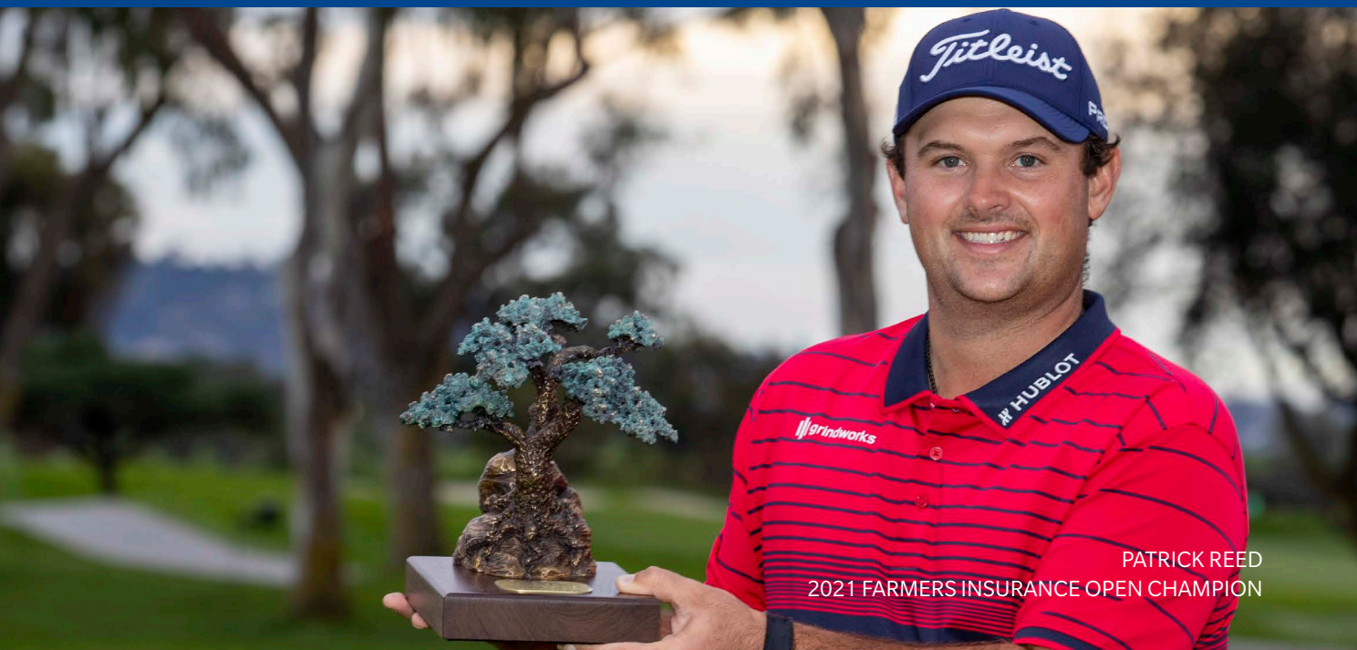
PATRICK REED 2021 FARMERS INSURANCE OPEN CHAMPION