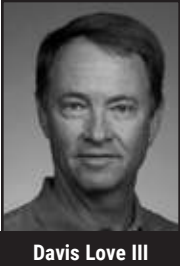
Davis Love III

TPC Sawgrass Ponte Vedra Beach, FL March 26-29 Purse: $1,800,000 Par: 36-36-72 Yards: 6,896