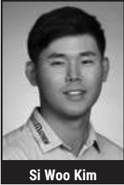
Si Woo Kim

TPC Sawgrass Ponte Vedra Beach, FL May 8-14, 2017 Purse: $10,500,000 Par: 36-36-72 Yards: 7,189