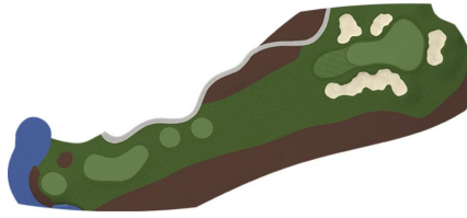
17 th Hole - Rattler