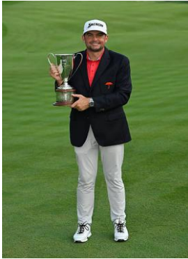
Keegan Bradley Travelers Championship

Keegan Bradley earned his 8 th PGA TOUR career win in his 368 th start. Bradley becomes the 8 th player to win the Travelers Championship multiple times (2023 & 2025).