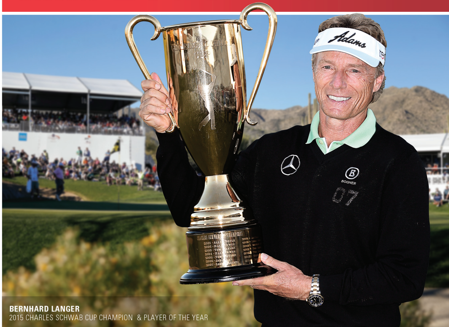
BERNHARD LANGER 2015 CHARLES SCHWAB CUP CHAMPION & PLAYER OF THE YEAR