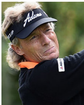
Winner: Bernhard Langer $270,000.00 71-68-65 204 (-12)