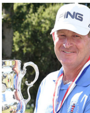
Winner: Jeff Maggert $675,000.00 70-65-70-65 270 (-10)