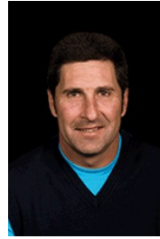
Jose Maria Olazabal 2016