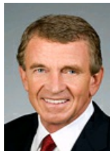
Tim Finchem Commissioner