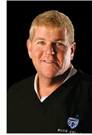
John Daly 2016

The following players will turn 50 in the coming years: