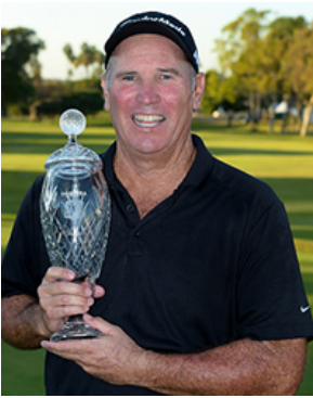
Winner: Duffy Waldorf $270,000.00 67-60-66 193 (-20)

Newport Beach, CA October 30-November 01