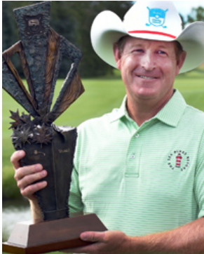
Winner: Jeff Maggert $352,500.00 67-63-64 194 (-16)